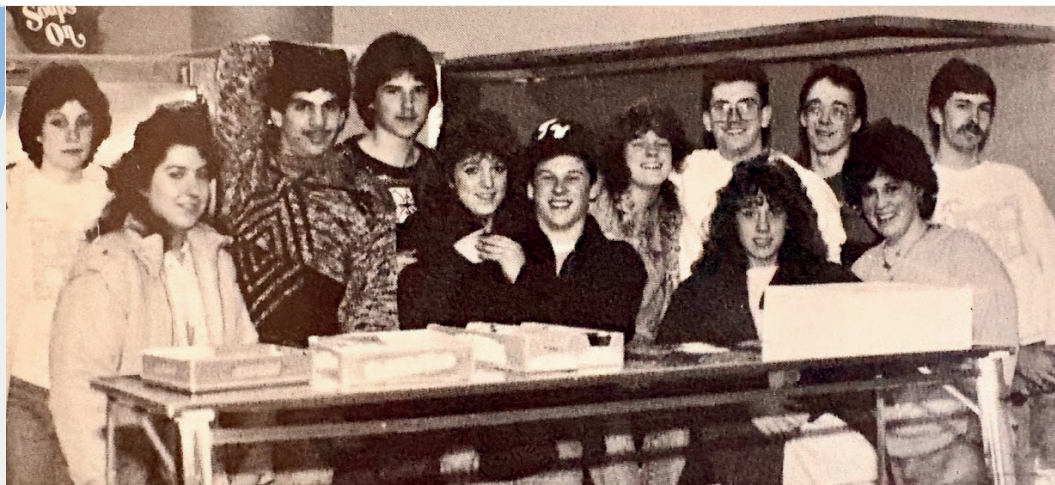
This summer we highlighted Tri-Valley alumni on social media. This photo is of some students from the Class of 1988.